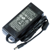
24V 2.5 A power adapter