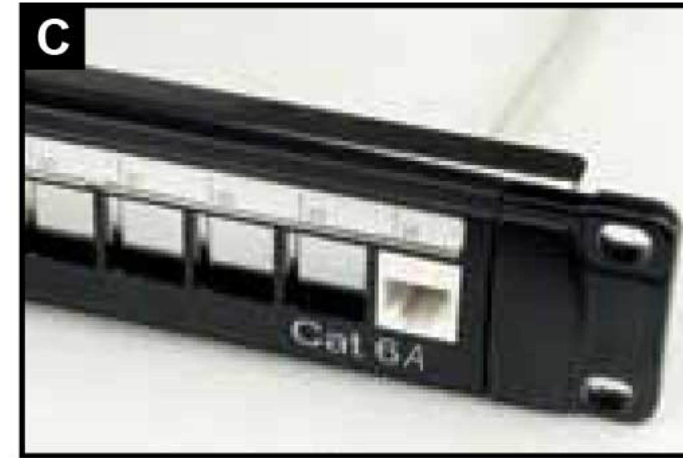
Insert the jack into the mounting location properly.