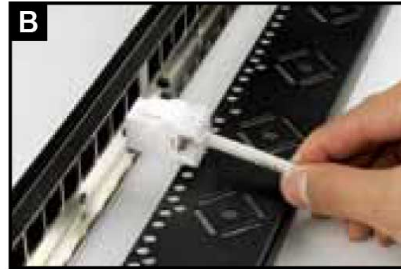
Position the unshielded keystone jack for installation.