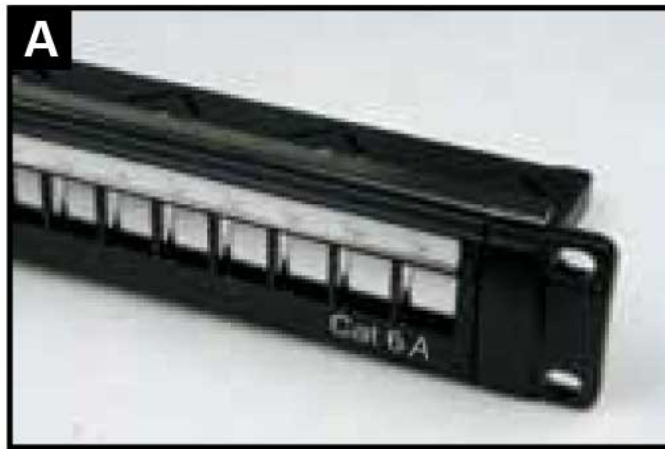
The bracket of Cat 6A patch panel.