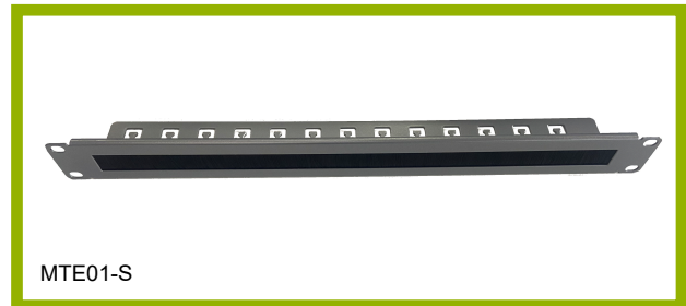
1U cable management

CABLE MANAGEMENT, 19inch, 1U, silver color.