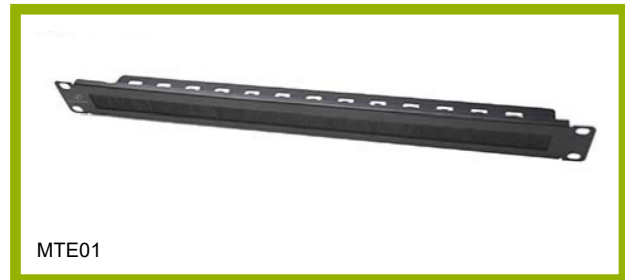
1U cable management

CABLE MANAGEMENT, 19inch, 1U, black color.